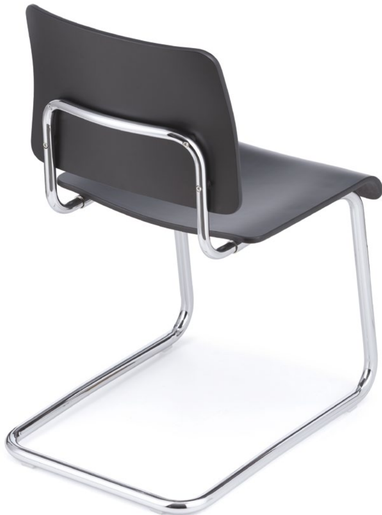
Arnold Bauhaus Collection