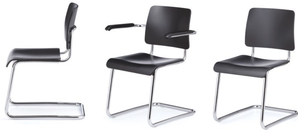
weimar cantilever chair 5012 and armrest cantilever chair 5112.