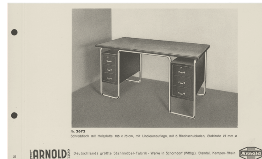
Illustrations from the Arnold catalogue of 1929/30.